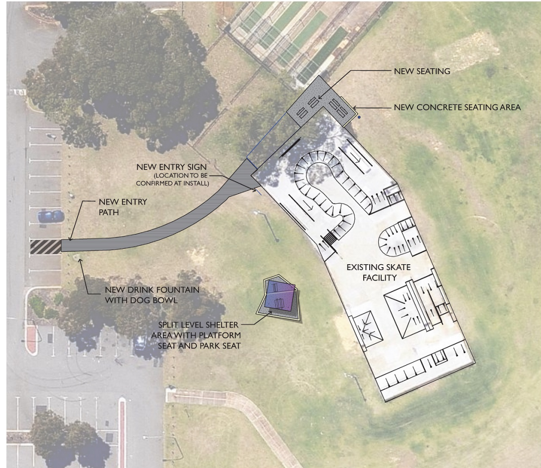
Carine skate facility landscape upgrade concept January 2014