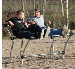
proposed skate area seating

For more information please contact the City of Stirling on 9205 8555.