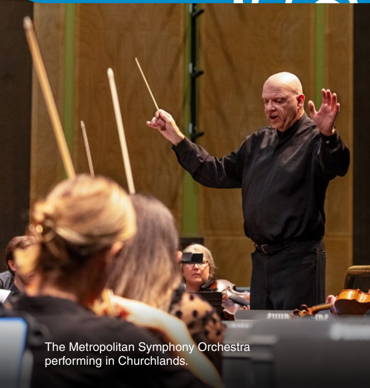
The Metropolitan Symphony Orchestra performing in Churchlands.