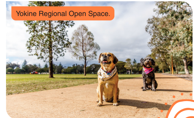
Yokine Regional Open Space.

Residents appreciated the convenience of nearby amenities within walking distance, access to public transport routes, and the suburb's proximity to the CBD. Residents told us Lawley Ward is an active and vibrant community to live in.