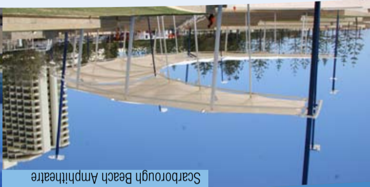
Scarborough Beach Amphitheatre

The walk consists of three loops: Scarborough Coastal Loop – Red (1.2 km) — Explore the unique history of the Scarborough beachfront, the hub of the Sunset Coast. At a leisurely pace this loop takes approximately 30 minutes. Trigg Coastal Loop – Blue (2.9 km) — From fishermen to settlers, surfers and swimmers - take a walk back in time to Trigg Island. At a leisurely pace this loop takes approximately 1 hour. Trigg Bushland Reserve Loop – Green (3.2 km) — Discover unique wildflowers – enjoy spectacular coastal views and sightings of birds and reptiles. At a leisurely pace this loop takes approximately 1 hour. The complete walk (all three loops) is approximately 7.3 km long. At a leisurely pace this walk will take 2.5 hours to complete. Please note: The walk path is only partially wheelchair accessible.