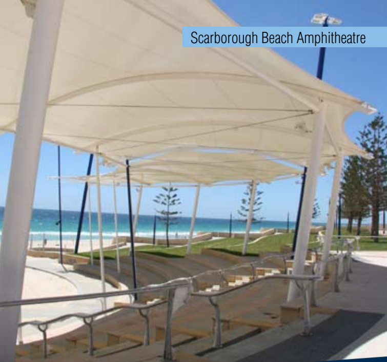
Scarborough Beach Amphitheatre